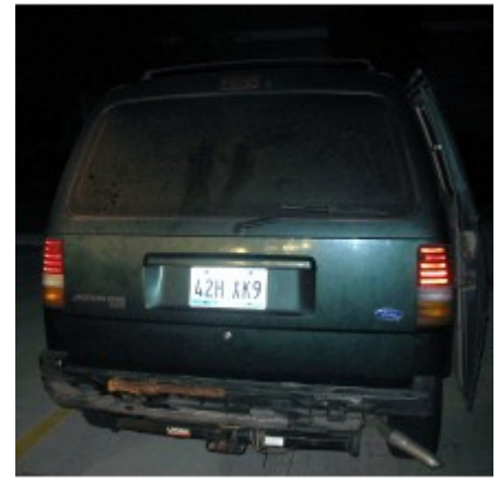
1995 FORD VAN, TX LP# 42HXX9

THE ABOVE PICTURED SUSPECTS ARE BELIEVED TO BE INVOLVED IN THE THEFT OF CENTRAL AIR CONDITIONER EVAPORATOR COILS FROM ROOF-TOP UNITS OF BUSINESSES.